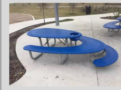
Wheelchair and infant friendly benches (in wood, not plastic)